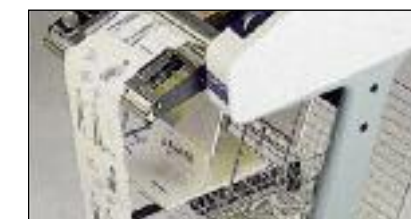
pre-decollating station for refolding in-line