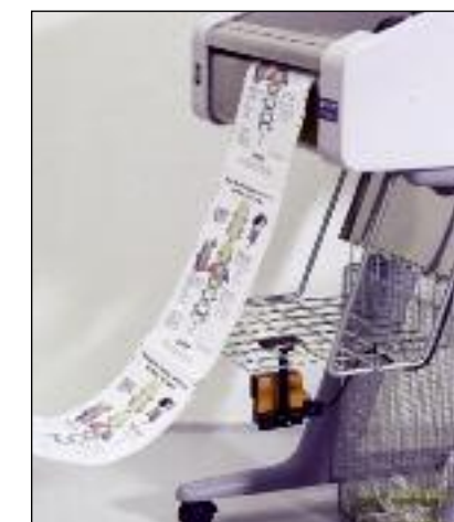
on-line connection to printer