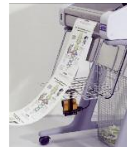
on-line connection to printer