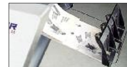
stacker M 3000