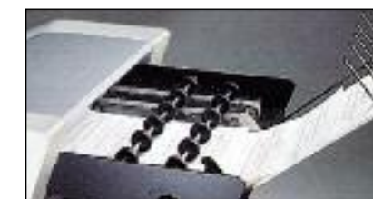
sheet-by-sheet stacker M 3010