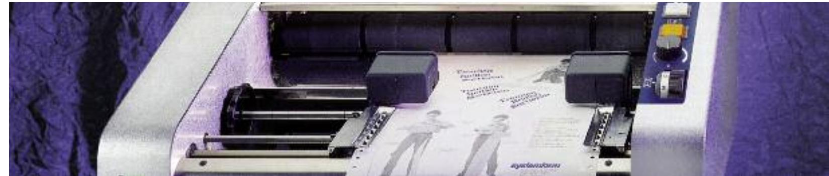
The small burster with a high work capacity.

MICROPLEX Printware Corporation 100 Northfield Road Bedford, OH 44146, USA Phone: 440.374.2424 Fax: 440.374.2422 Toll Free: 877.99SOLID info@MICROPLEX-USA.com